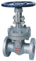
FIG. 272-CS-300 Class 300, Flanged ends, bolted bonnet, WCB body & bonnet, 13Cr/HF trim.